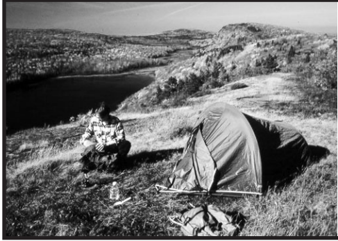
Escarpment Trail overlooking Lake of the Clouds.

This manual provides you with important information concerning wilderness camping in Porcupine Mountains Wilderness State Park from mid-June through August. It is essential that you and all